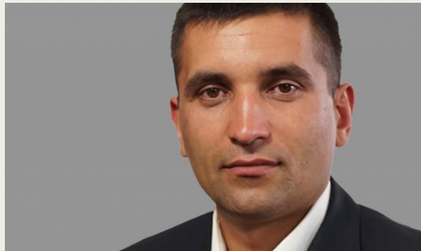
IVAN BELCIUG Mayor of Dondușeni City

Dear investors from the Republic of Moldova and abroad,